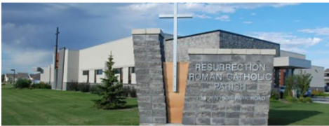
Livestreamed Masses from Resurrection Parish