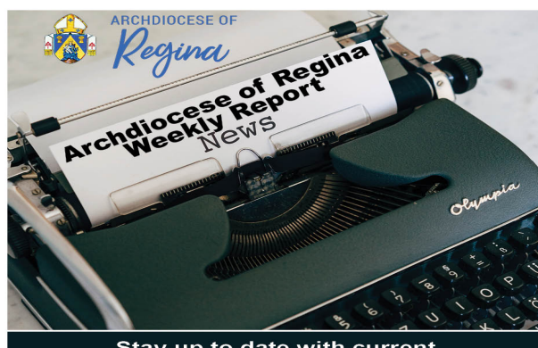
Stay up to date with current Archdiocese of Regina News and covid-19 updates. Sign up for free today!!

Through the Summer the English Mass will be livestreamed from Resurrection Parish, and Christ the King Parish, Regina at 9:00 AM daily French Mass will be livestreamed from St. Jean Baptiste every 2 weeks, visit <a href="https://www.archregina.sk.ca/live">www.archregina.sk.ca/live</a>