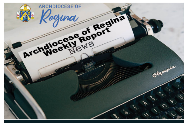
Stay up to date with current Archdiocese of Regina News and covid-19 updates. Sign up for free today!!