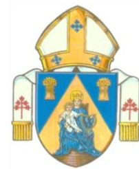
Archdiocese of Regina Coat of Arms

Holy Rosary Cathedral respectfully acknowledges that we are situated on Treaty 4 territory, traditional lands of First Nations and Métis people.