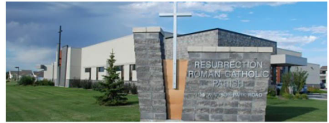
Livestreamed Masses from Resurrection Parish

The Archdiocese is looking for good news items to feature! Please send us a brief write-up about good news and good works coming out of your community, so that we may thank God for them and hopefully inspire others as well. Is your parish doing some kind of outreach? Gathering virtually to pray? Have you taken to the streets with signs of faith? Can you share with us pictures of your family praying or participating in mass from your home? Please email us at yomo@archregina.sk.ca by June 1st with a paragraph, pictures and or video clip. Please be generous in taking the time to share these good news stories. They are much needed.