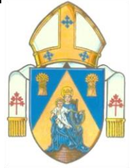
Archdiocese of Regina Coat of Arms