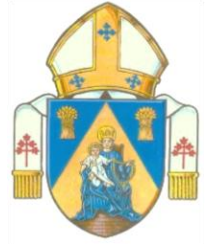
Archdiocese of Regina Coat of Arms

Holy Rosary Cathedral respectfully acknowledges that we are situated on Treaty 4 territory, traditional lands of First Nations and Métis people.