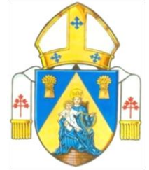
Archdiocese of Regina Coat of Arms